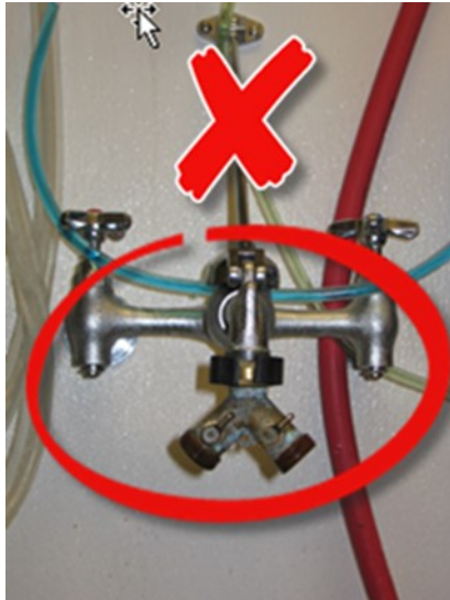
Figure 6 – Unapproved Connection

Y-valves and similar downstream shut-off devices that have an integral shut-off valve (e.g. solenoid, butterfly valve, ball valve, spray nozzle, etc.) connected to a faucet equipped with an integral AVB, including shut-off type spray nozzles and chemical dispensing units, are not permitted on a faucet equipped with an AVB, due to device's inability to be under constant pressure as this will result in failure of the backflow device. There is now a potential cross-connection hazard. See Figure 6.