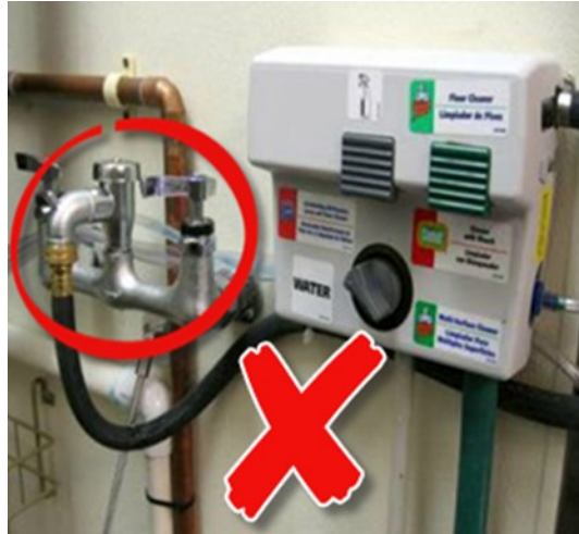
Figure 4 – Unapproved Connection

ASSE 1001 performance requirements for AVB devices state that these backflow preventers are not designed for applications where they could be subjected to continuous water pressure, and are not testable for maintenance. Under such installations the AVB devices will fail under constant pressure conditions. There is now a potential cross-connection hazard. See Figure 4.