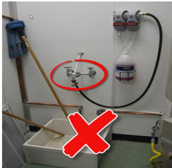
Figure 5 – Unapproved Connection

Installing a Y-valve, similar downstream shut-off device, or obstruction places back pressure on the AVB. Both sides of a Y-valve connected to a sink for a chemical dispenser are pressurized; one side supplying water to the chemical feeder and the other side to the shut-off valve on the Y-valve, or to a hose attached. Since, AVB's could be kept on under constant pressure at all times, they will fail under such installations. When the faucet is used with a hose on the open side of a Y-valve, there is now a potential cross-connection hazard. See Figure 5.