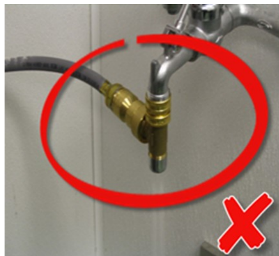
Figure 7 – Unapproved Connection

Installing a “side-kick”, similar downstream shut-off device, or obstruction places back pressure on the AVB. Since the atmospheric vacuum breakers could be kept on under constant pressure at all times, they will fail under such installations. Chemical dispensers that are connected to a faucet with a pressure bleeding device on the faucet outlet, this includes devices referred to as a wasting tee, flow-through device, or otherwise known as a “sidekick” device are considered obstructions and are not approved by the Department, as they are prone to fouling/plugging failure under typical water and operating conditions found within Maricopa County. There is now a potential cross-connection hazard. See Figure 7.