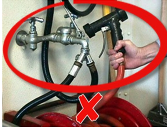
Figure 8 – Unapproved Connection

All cross-connection hazards must be prevented, and all plumbing must be in compliance with current codes and Department requirements.