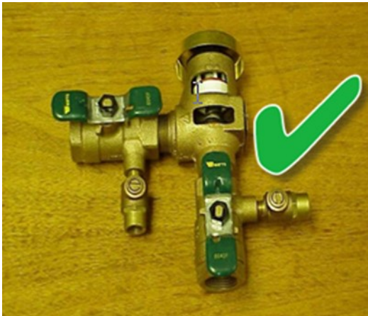
Figure 3b – Reduced Pressure Principle Zone Assembly (RPZ)